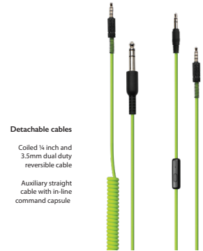
Detachable cables Coiled 1/4 inch and 3.5mm dual duty reversible cable Auxiliary straight cable with in-line command capsule